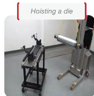
Hoisting a die