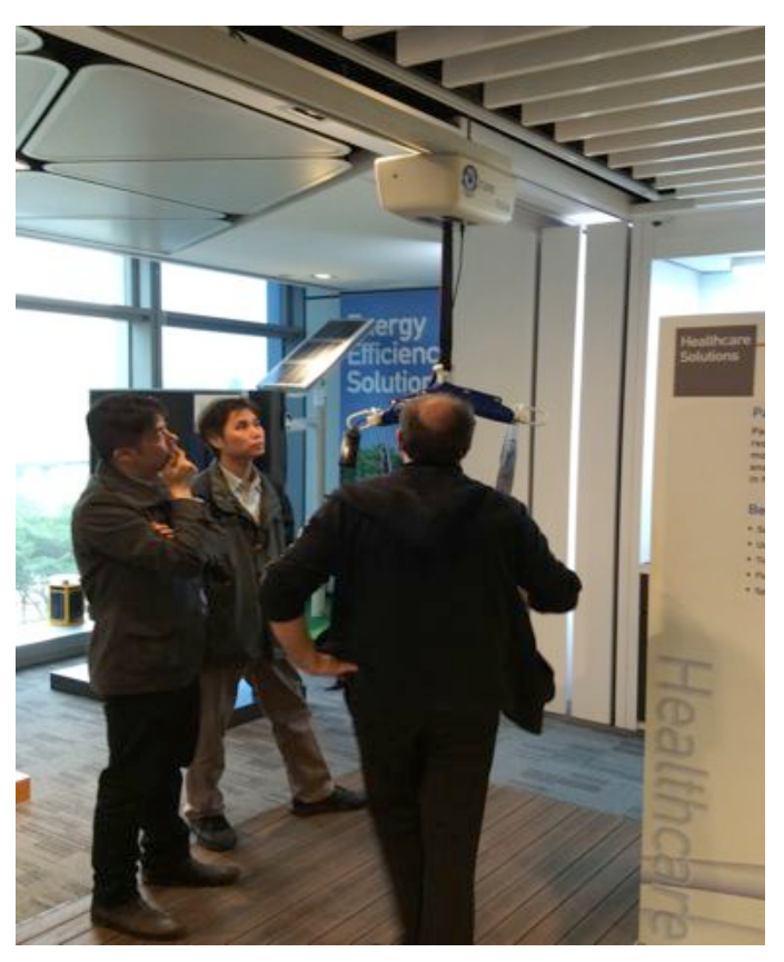
The OT200 is a self-charging unit with a weight capacity of 200kg to 400kg. The unique gravity-charging, no tools emergency lower and 6 point hanger bar ensure flexibility and reliability

The OT200 has been installed in the Physiotherapy, Occupational Therapy, Prosthetics as well as the General Wards.