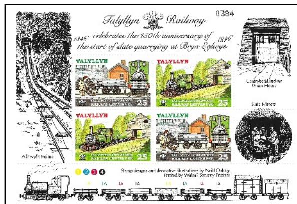
Above sheet issued in 1996, very few remaining.

Web: www.talyllyn.co.uk/experiences/railway-letter-service