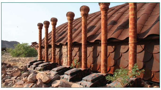
Tourist travellers are using Enviro Loo at the Twyfelfontein World Heritage site (above) and Bloedkoppie.

In Namibia, the Enviro Loo system is successfully used in different environments. Below are some examples: