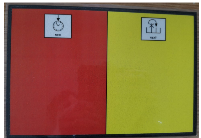
A Now and Next card

Jody in Senior 2 has been working really hard on learning how to use a Now and Next card. The class team add photos to the card of the activities that Jody is going to do 'now' and what's going to happen 'next'. The team present the card to Jody regularly during the day to signal changes in activities and what Jody needs to do. Using simple language, the team say and point to 'now shoes—next toy' for example. By giving Jody the visual support and using motivating toys or activities for the 'Next' activity, Jody is having more and more success in carrying out tasks and transitions she was finding tricky. Superb work