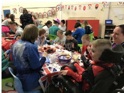
A race against time in the Bake-off in the hall.

Thank you to everyone who sponsored pupils for this year's Comic Relief. We raised an impressive £595.45 from our cake sale and sponsored danceathon. Classes at school competed against each other in a very impressive 'Bake off', with special guests 'Mary Berry' and 'The Swedish Chef' judging proceedings and misbehaving with lots of flour!