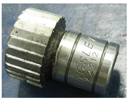
24 (27) Teeth Ratchet Ring Tool for MTB, ROAD, Right Side Drive BMX