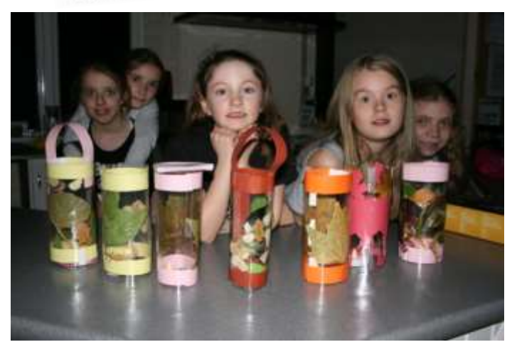
Autumn Leaves Tea Light Shades