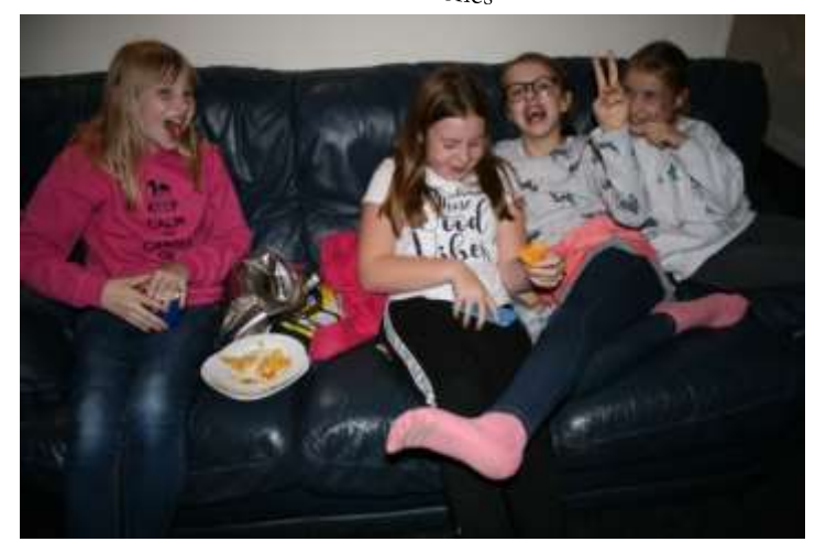
Girls group enjoying cinema snacks at Movie Night Upstairs at UTASS