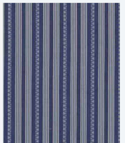
KILIM STRIPE – BLUE BF10911/1