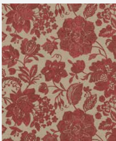
BERWICK – RED BF10918/2