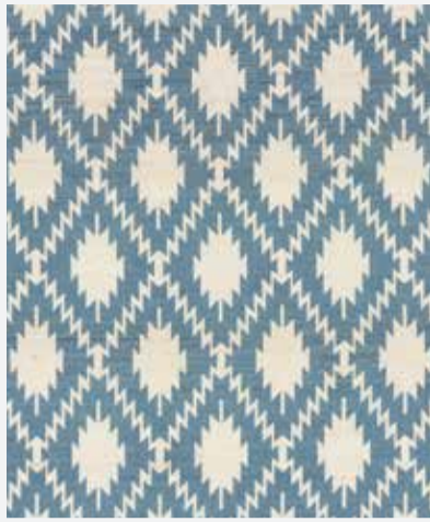
BAGATELLE – BLUE BP10908/1