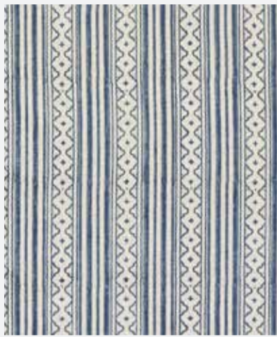
EBURY STRIPE – INDIGO BP10914/1