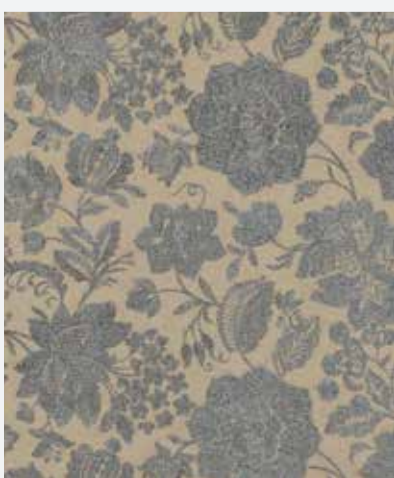
BERWICK – BLUE BF10918/1