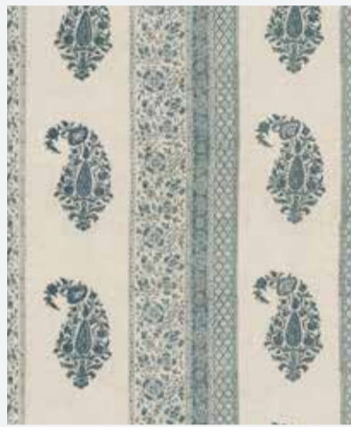
PORTOBELLO – BLUE BP10915/1