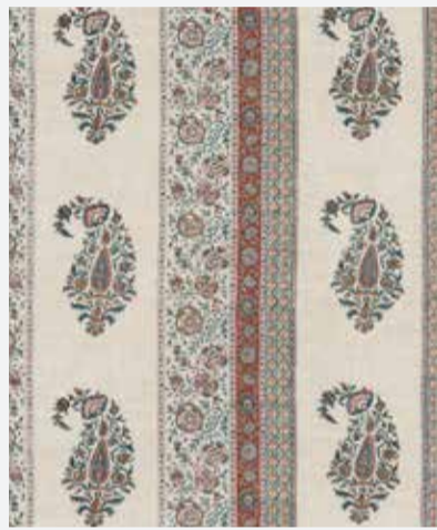
PORTOBELLO – RED/BLUE BP10915/2