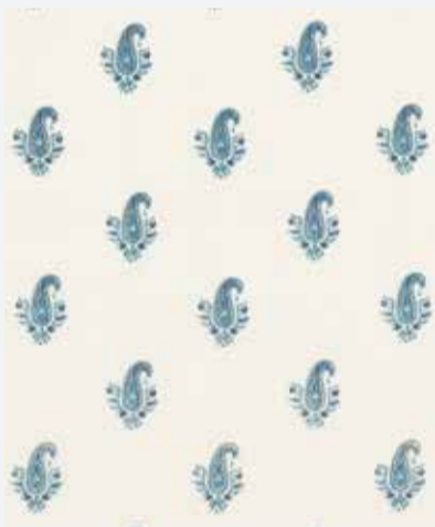
PIMLICO – INDIGO BP10934/1