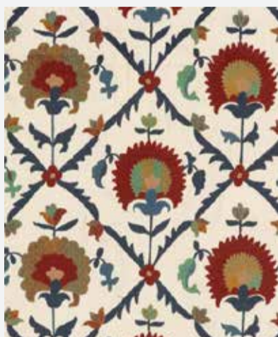
WINCHELSEA – RED/BLUE BF10905/1