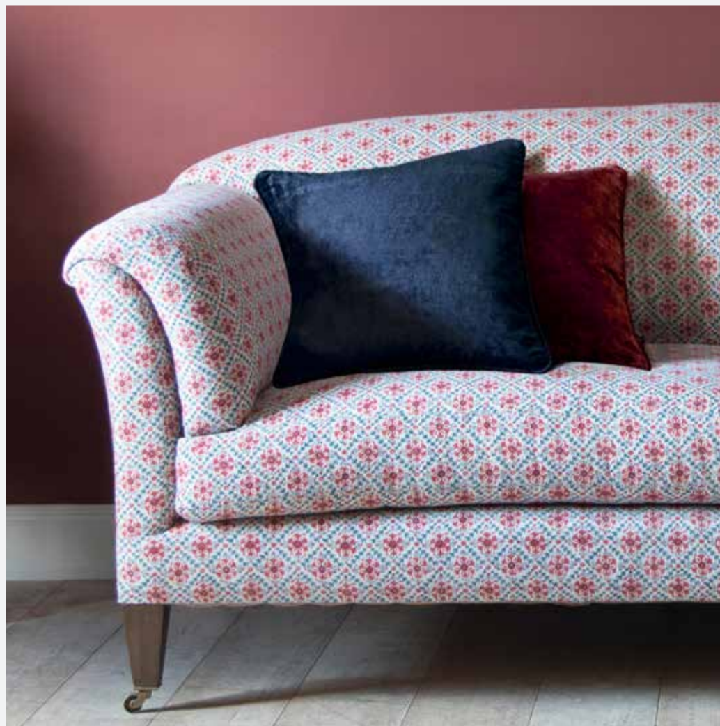
TOP IMAGE: SELECTION OF FABRICS FROM THE ESSENTIAL COLOUR II COLLECTION. ABOVE LEFT: CHAIR: BAKER HOUSE VELVET – INDIGO, CUSHION: JAIPUR POPPY – RED/BLUE ABOVE RIGHT: SOFA: CAMDEN TRELLIS – RED/BLUE, CUSHIONS: BAKER HOUSE VELVET – BALTIC AND RUBY