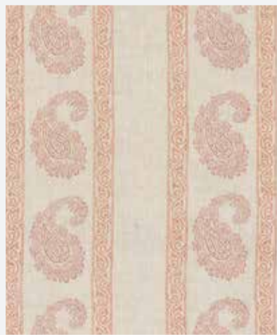
VINTAGE PAISLEY – RED BP10919/2