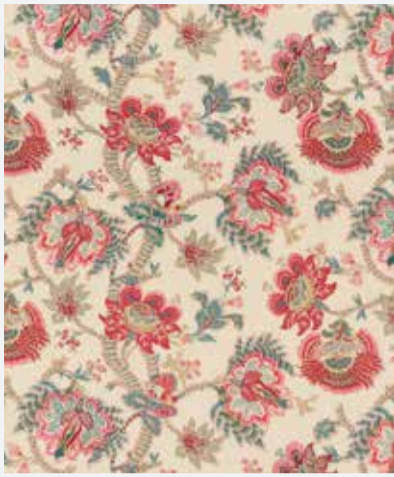
KINGHAM – RED/BLUE BP10903/1

Designed to create an atmosphere of comfort and ease the Portobello collection is quietly elegant, offering a sophisticated twist on the trend for relaxed, country living. The collection conjures the enduring trend for restrained, understated luxury of grand manor and country house interiors with their softly worn textiles, charmingly mismatched English china and fading grandeur.