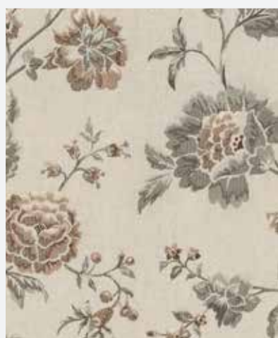
RYE – PARCHMENT BF10922/1