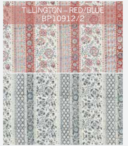
TILLINGTON – RED/BLUE BP10912/2