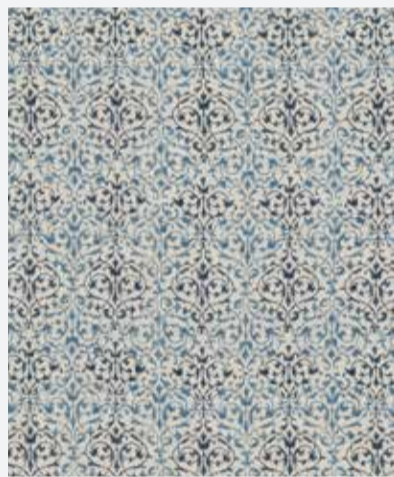
ARABESQUE – BLUE BP10920/1