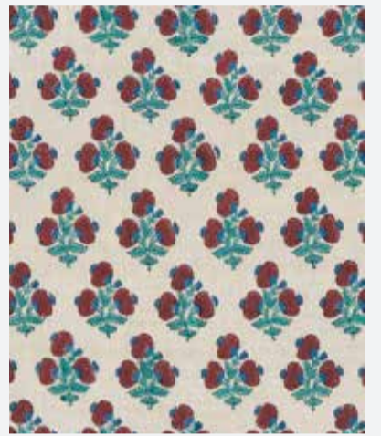
JAIPUR POPPY – RED/BLUE BP10916/1