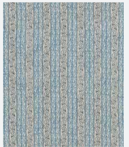
TETBURY STRIPE – BLUE BP10921/1