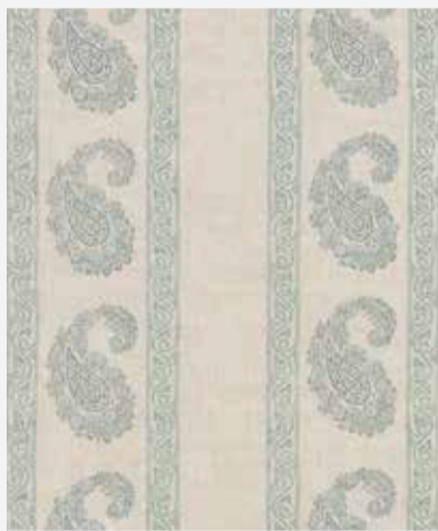
VINTAGE PAISLEY – BLUE BP10919/1