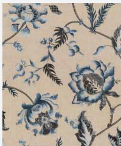
ANTIQUÉ TRAIL – INDIGO BF10906/1