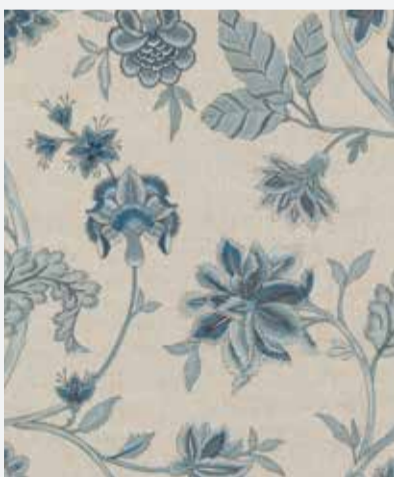
ARUNDEL – BLUE BF10904/1