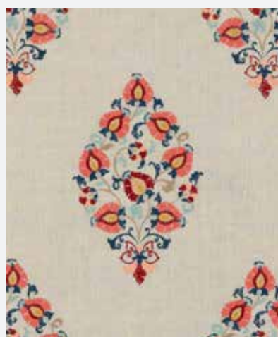
WOOTON – RED/BLUE BF10923/1