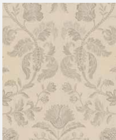
AMBERLEY – PARCHMENT BF10907/1