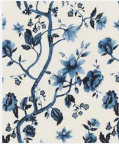
PETWORTH – INDIGO BP10910/1