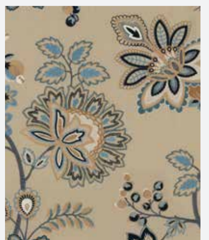
BURFORD EMBROIDERY – BLUE BF10924/1