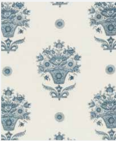
PONDICHERRY – INDIGO BP10913/1