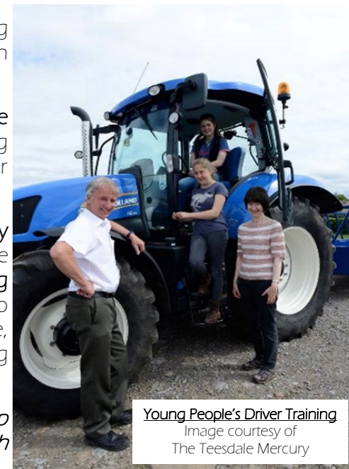
Young People's Driver Training