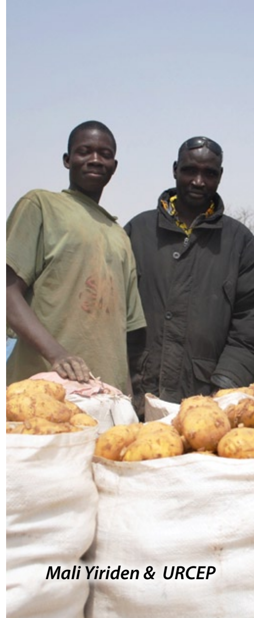
Mali Yiriden & URCEP

Mali Yiriden & URCEP , potatoes. These two trader cooperatives, which buy from smallholder farmers for resale, aim to increase sales to retailers in Mali and wholesalers in Burkina Faso, Ghana, Nigeria and Togo. This partnership has helped improve competitiveness in several ways. More than 3,000 farmers are using improved production methods, new seed potato varieties and better post-harvest management and storage. Traders are able access credit. Coordination among value chain actors has improved. The goal: by 2017, source from 5,000 farmers, expand trade to 10,000 tons per year.