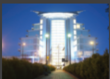
St David's Hotel, Cardiff Bay