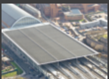
St Pancras, London