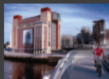
Baltic Centre, Gateshead