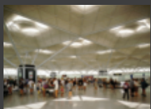
Passenger Terminal, Stansted Airport