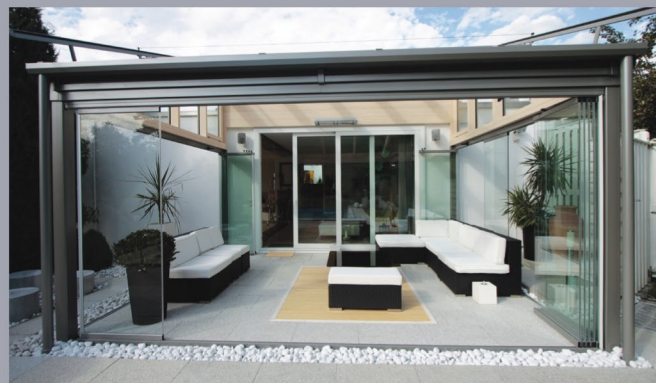
slide & turn systems