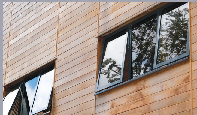
windows & doors