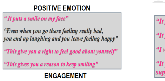
Figure 3: An example of themes identified in the qualitative analysis: -

The qualitative data collected after the Down to Earth Neurorehabilitation program mapped nicely onto this model. See Figure three for an example of this.