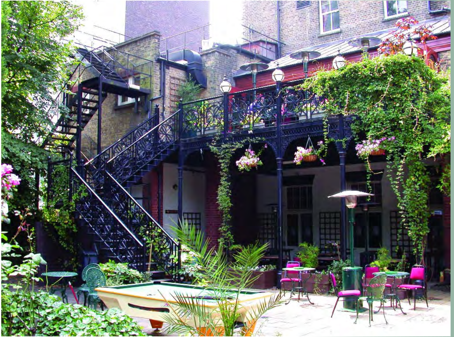
PUB BALCONY, LONDON ▲ BANDSTAND, PAVILION GARDENS, BUXTON ►