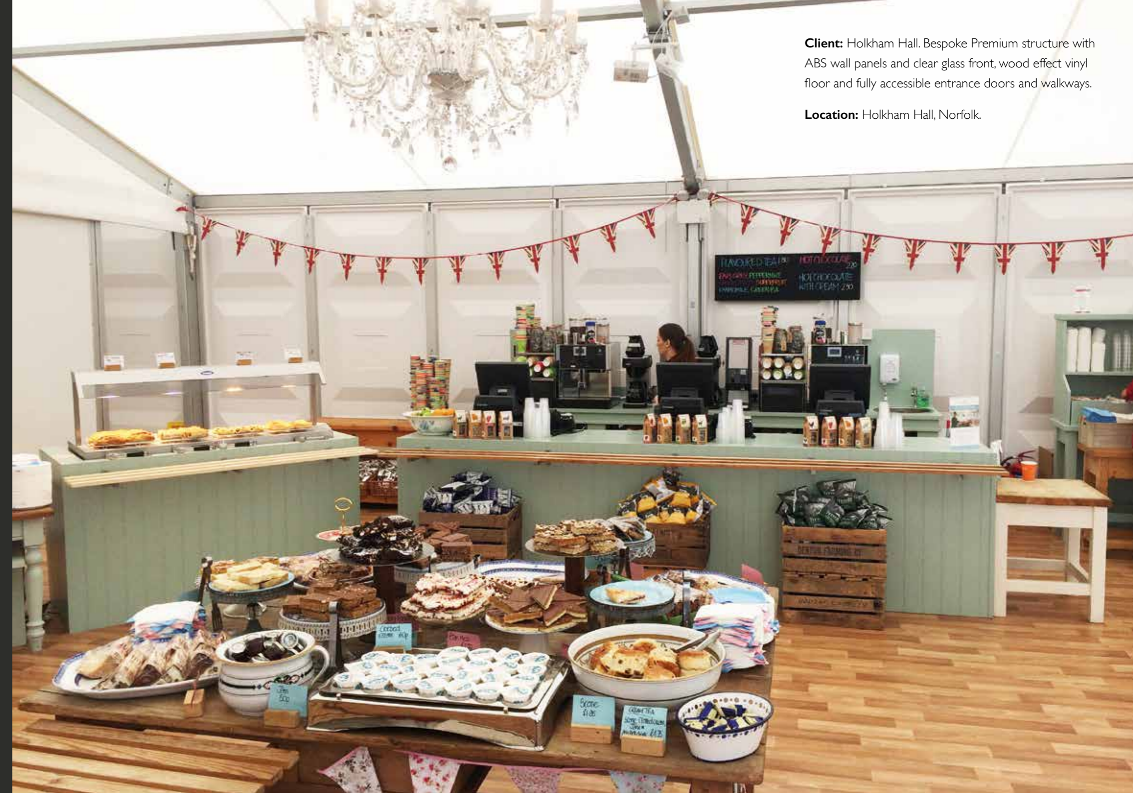
Client: Holkham Hall. Bespoke Premium structure with ABS wall panels and clear glass front, wood effect vinyl floor and fully accessible entrance doors and walkways.