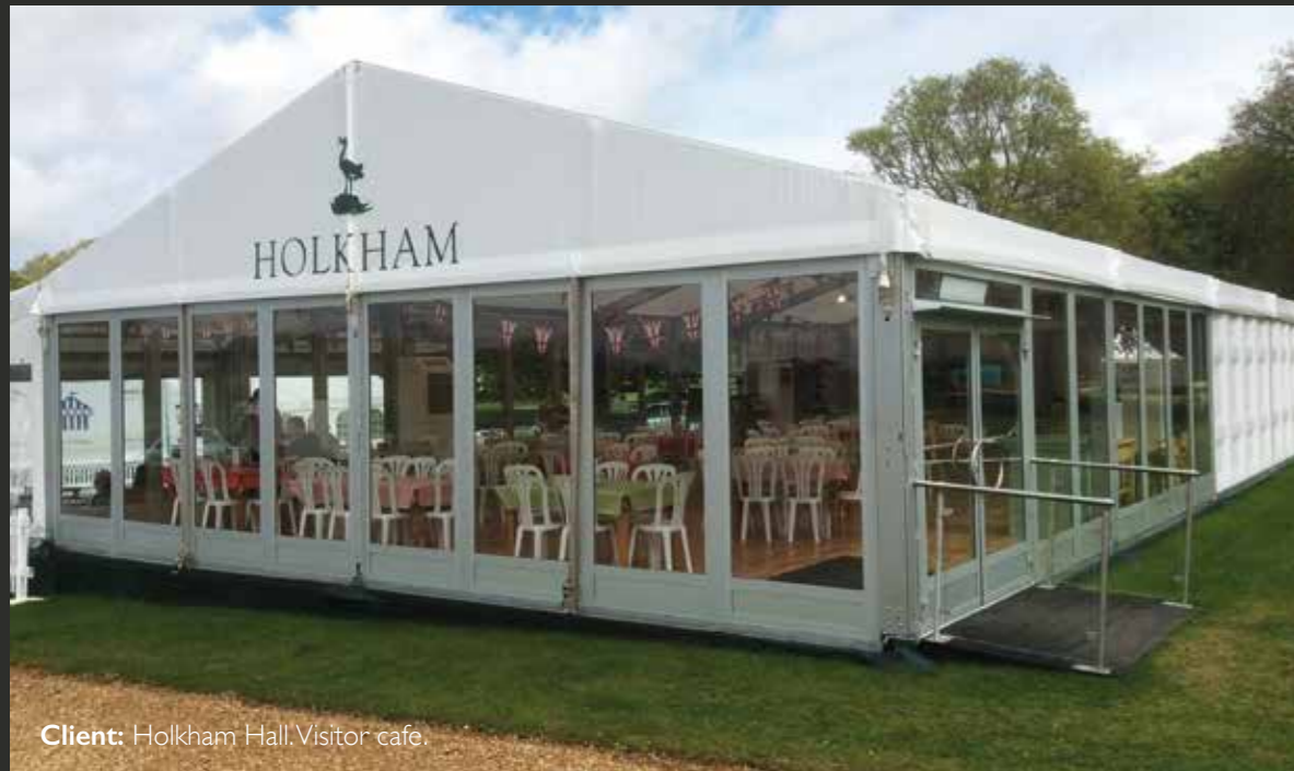
Client: Holkham Hall. Visitor cafe.