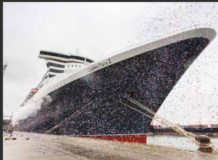
Client: Cunard Queen Mary 2. Location: Southampton Docks.