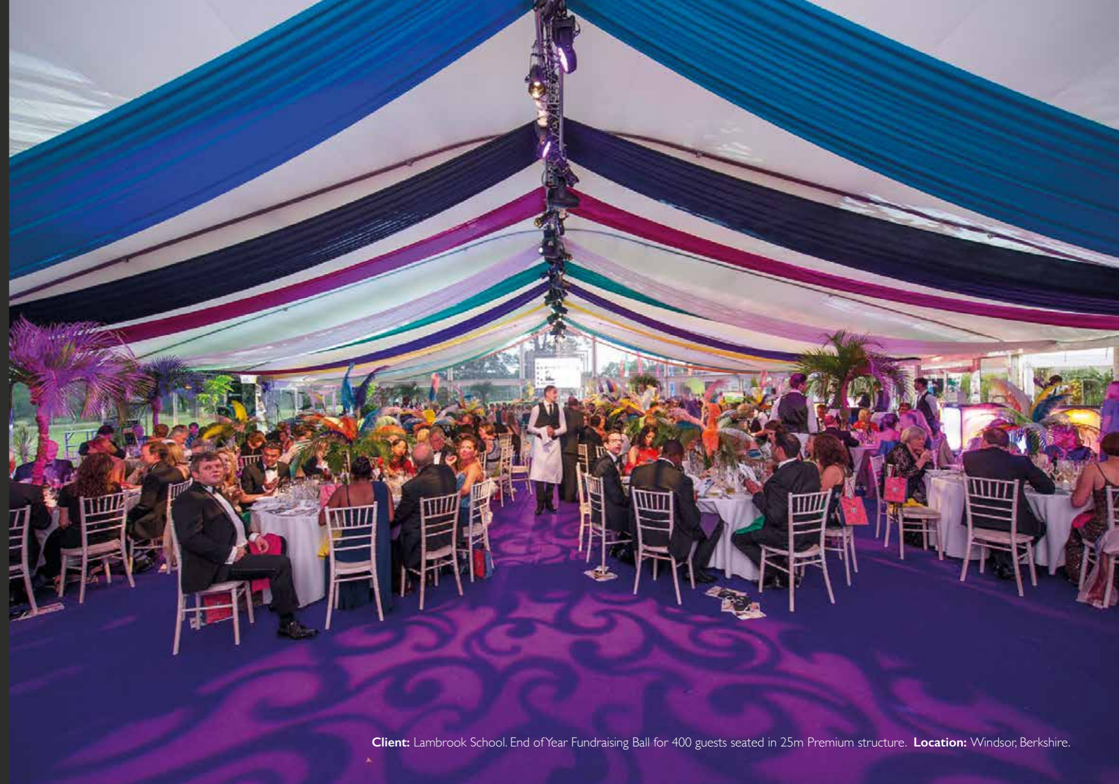
Client: Lambrook School. End of Year Fundraising Ball for 400 guests seated in 25m Premium structure. Location: Windsor, Berkshire.