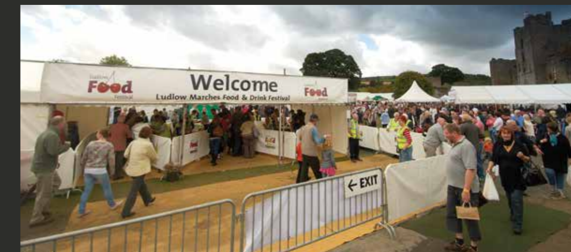
Client: Ludlow Food Festival. Location: Ludlow Castle, Shropshire.

We offer a broad range of marquee styles from large structures for entertaining thousands of guests to small catering, VIP or service marquees. Our structure can be finished with a variety of lining options, which include a range of stock options from contemporary white flat to black LED starcloth. We also supply an extensive range of indoor and outdoor furniture and full AV installations.