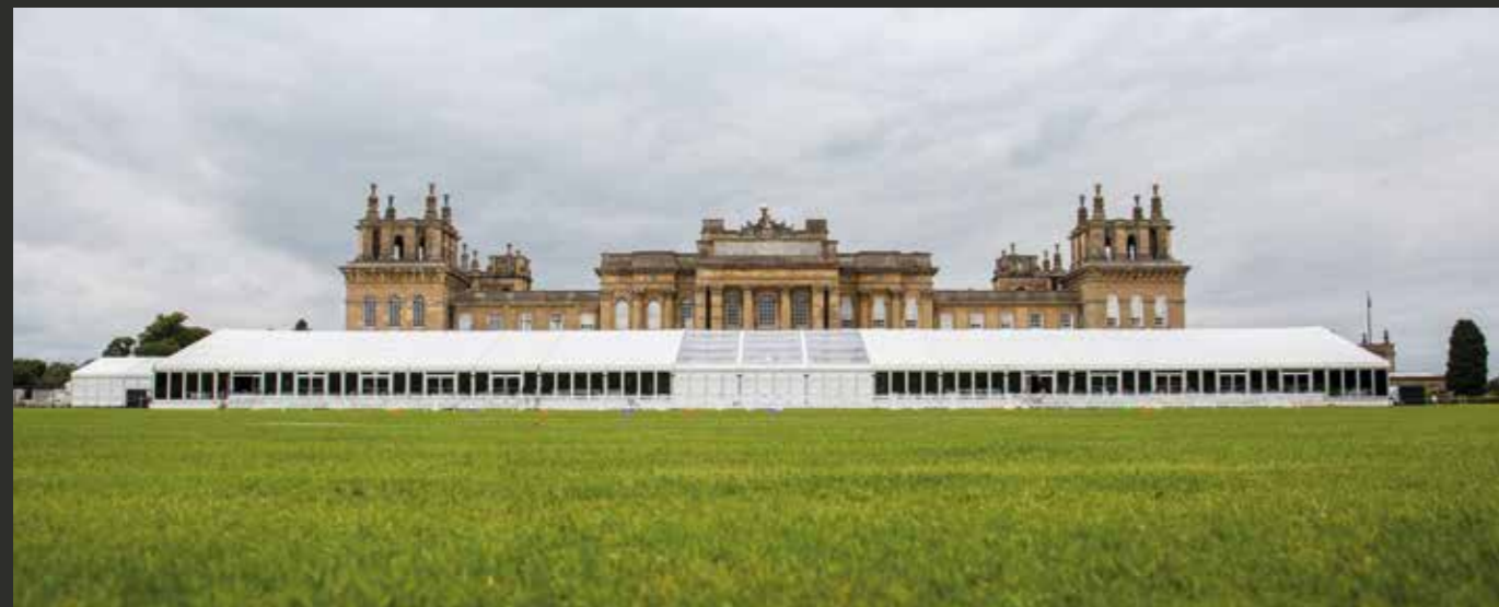
Client: Private Corporate Client. Location: Blenheim Palace, Oxfordshire.

We love creating bespoke and unique event venues with the most fabulous of interiors. The sky really is the limit here as inside our marquees anything is possible – from enchanted woodlands to swinging sixties, ice-white festive parties to Ibiza-themed nightclubs. Interiors can readily be adapted during the hire period to transform the space from one use to another. It's not uncommon to do this through the night, enabling clients to keep to their event schedule.