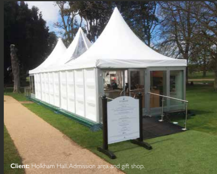
Client: Holkham Hall. Admission area and gift shop.