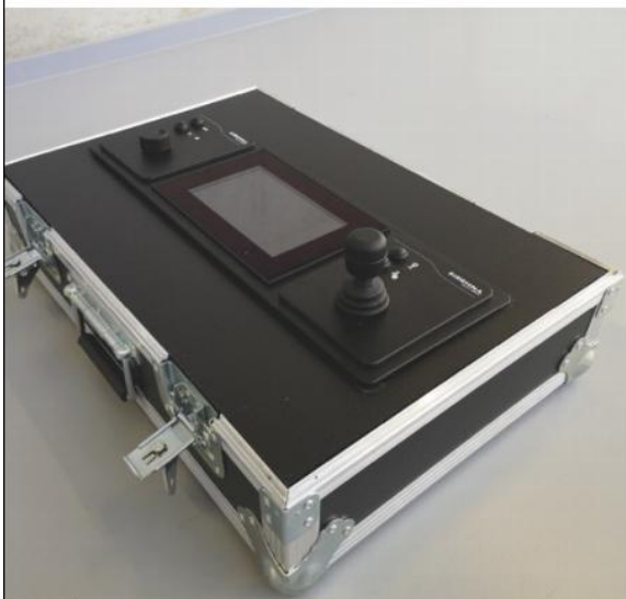
Diagram of the Argo system for integrated control of helm and stabilising fins.

The Argo system uses a joystick governing engines, fins, rudders and thrusters to handle the boat.