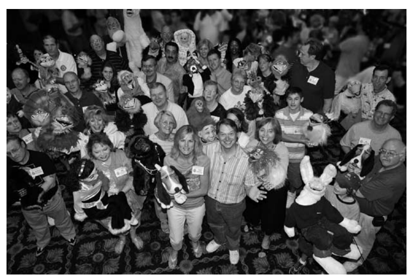
A convention photo of Axtell puppeteers.

During the '90s the popularity of Axtell puppets kept growing and has never stopped. Promoting the business at conventions and through individual sales people has kept the name Axtell out in the performing world and staying on the cutting edge of invention has kept performers coming back to Axtell again and again.