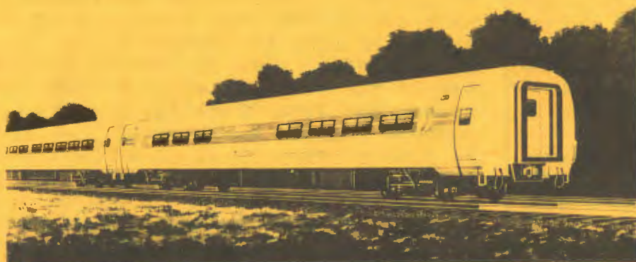
An artist's sketch of Amtrak's new Metroliner-type coaches being built by the Budd Co.