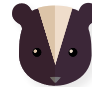
Badgers: 2 years to 3 years