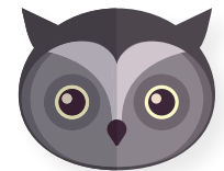
Owls: 3 years to 4 years