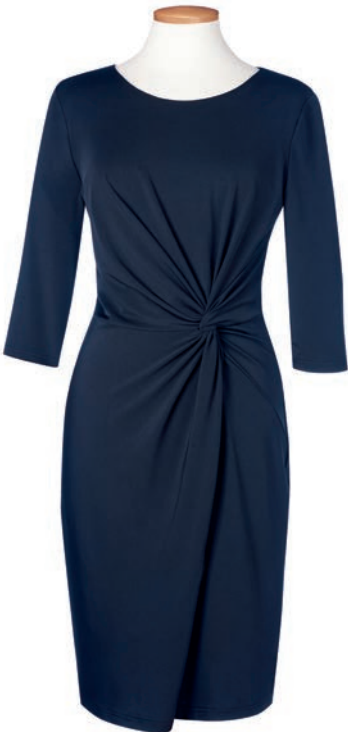
Centre back length at size 12R = 96.5cm

Black Slim waistband, belt loops & key loop, 2 side pockets, mock rear pockets,