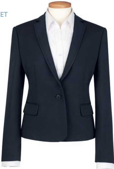
Centre back length at size 12R = 56cm

Navy 95% polyester/ 5% elastane, 220g, 3/4 sleeve, round neck, flattering fit with waistline detail, stretch lining.