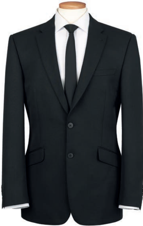
Centre back length at size 40R = 76cm

Navy 5 button front, 2 welt pockets, lining backed with adjuster.