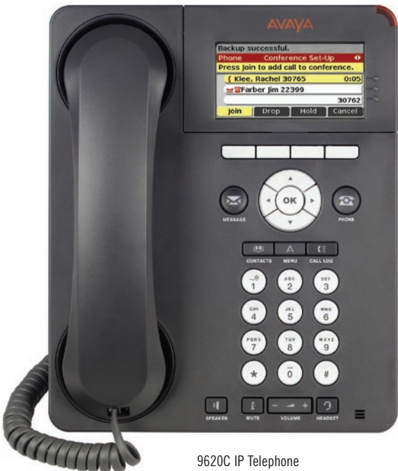
9620C IP Telephone

With the evolution of today's smart phones, PDAs, user interface design has made great leaps forward. Avaya's 9600 Series of IP Telephones have a clear and elegant interface. High resolution graphical displays make it easier to read contextual menus, prompts and instructions – anticipating your intentions and needs. Critical functions like call transfer, conferencing and forwarding are easy for beginner or veteran alike. Softkeys right on the display itself, along with scrolling menus, guide you through every process. Even third-party applications such as company-wide corporate directories can be invoked and used easily. The user interface is consistent across the entire