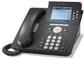
9640 IP Telephone