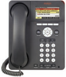
9620C IP Telephone