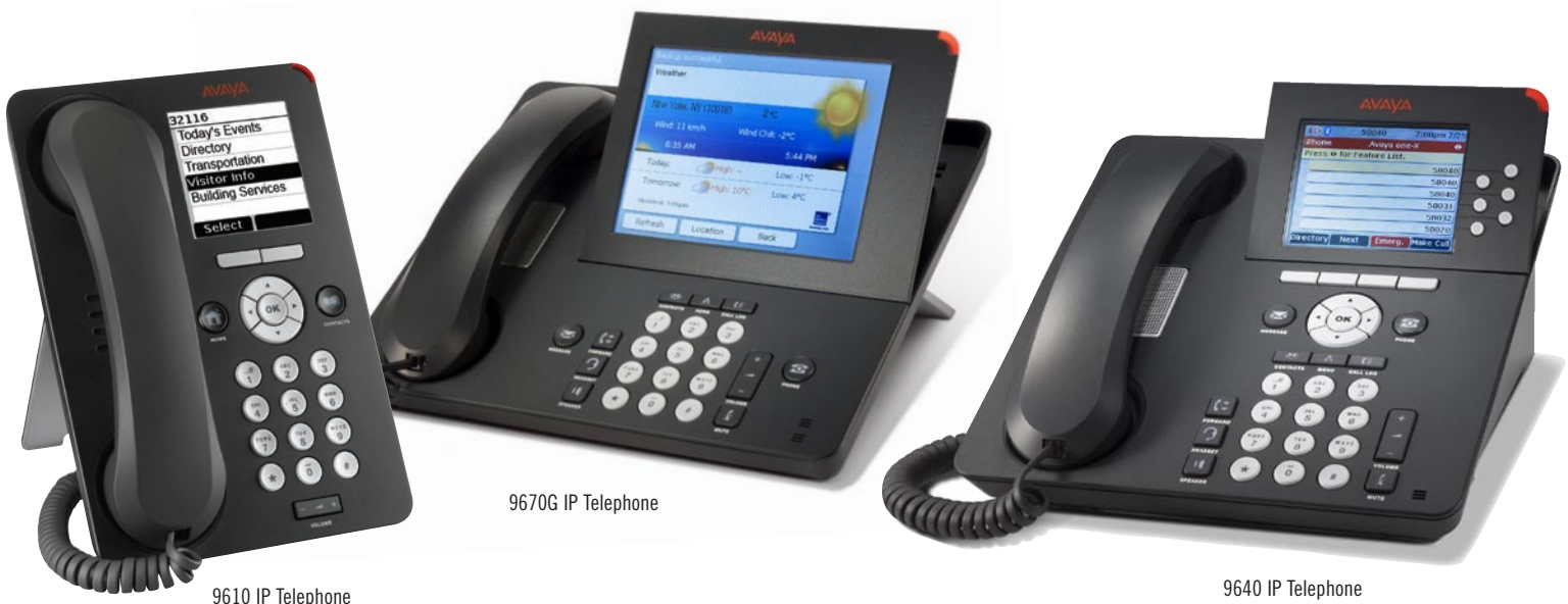
9610 IP Telephone

For the Navigator: the 9650 and Button Module. The Navigator also spends a great deal of time on the phone, largely handling calls for others. Receptionists and executive assistants are examples of Navigators. The 9650 provides one touch access to a great