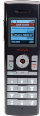
3631 Wireless IP Telephone

range of features and functions; it comes with an integrated button expansion module for quick access to features and people and super efficiency.