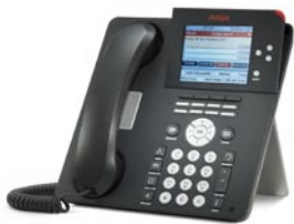
9650C IP Telephone