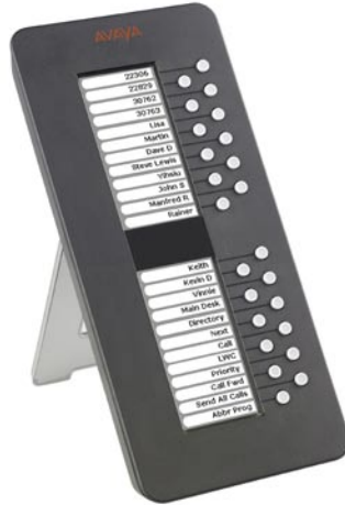
24 Button Expansion Module