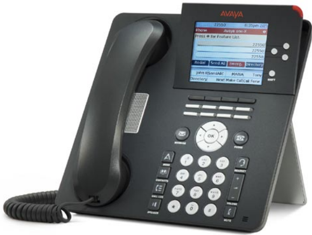
9650 IP Telephone