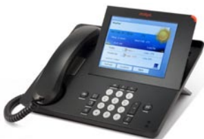
9670G IP Telephone