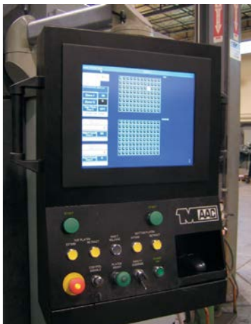
Computerized Machine Control

The latest technology in computerized machine controls offers huge benefits. Replacing relays and timers, manual buttons, and switches with flat panel touch screen interfaces and innovative software allows thermoformers the ability to change every machine parameter within seconds. This eliminates the manual process of setting up different machine sequences, adjusting limit switches, opening and closing valves, setting oven heat configurations, setting pressures and even reading job setup sheets. Not only can previ-