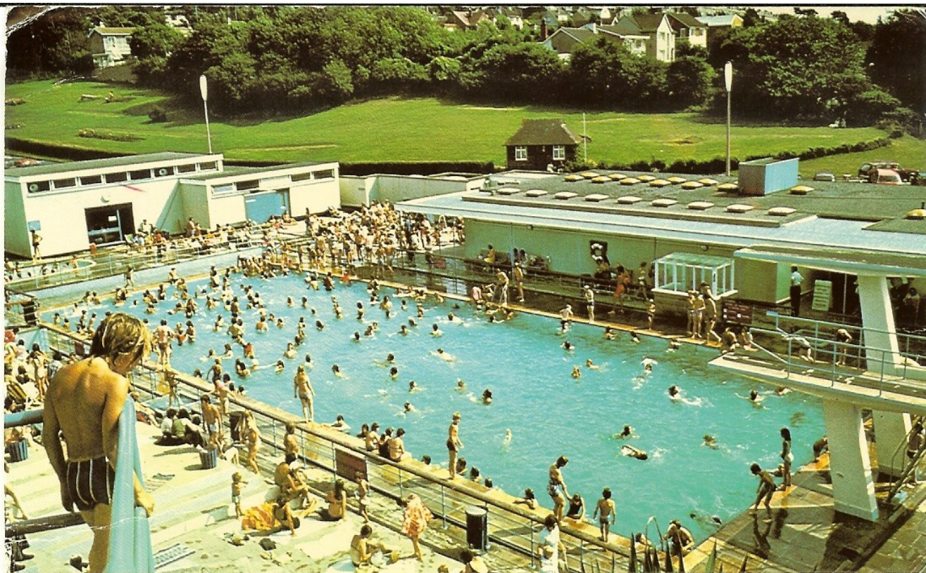
The Swimming Pool, Portishead