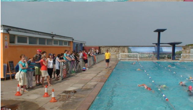
Triathletes wait for the whistle, while supporters look on.