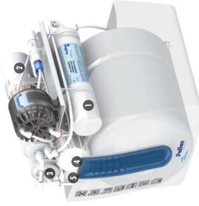
Our eco-friendly reverse osmosis unit in a compact version. 5102028380