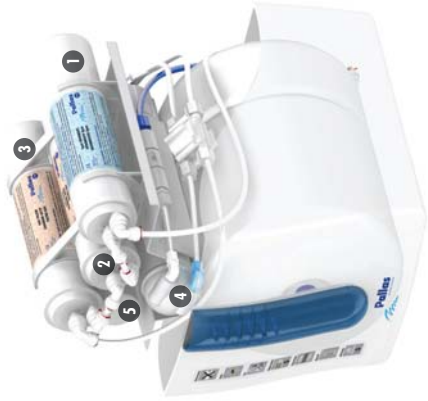
The finest filtration with modern style. 5102020002