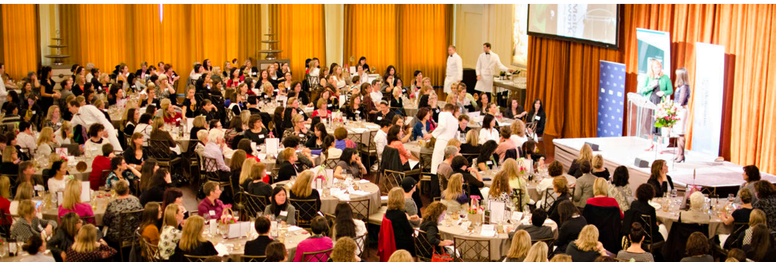
Photo Below: The Network's 2014 "Connecting Women in Biotechnology Luncheon", Mural Hall.

Sponsorship of this event is critical to its ongoing success and the Network is very appreciative of the many sponsors whom are long term supporters of this event. This year our sponsors were: CSL, Victorian Government, INC, Walter & Eliza Hall Institute, Phillips Ormonde Fitzpatrick, Melbourne Convention Bureau, Norton Rose and Starpharma.