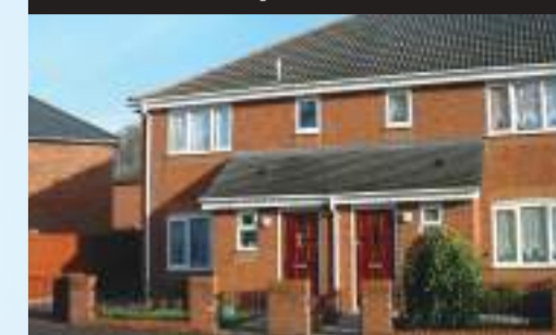
A Perry Common home today.