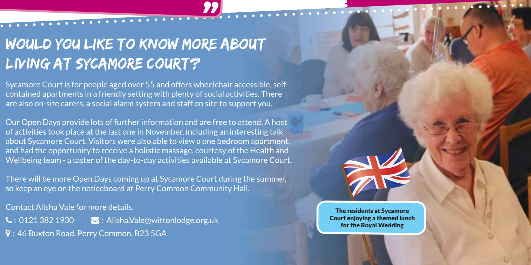
The residents at Sycamore Court enjoying a themed lunch for the Royal Wedding

📍 : 46 Buxton Road, Perry Common, B23 5GA