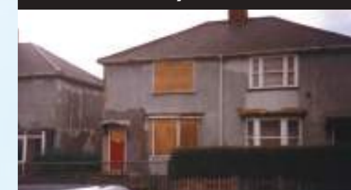
An old Perry Common Boothouse.