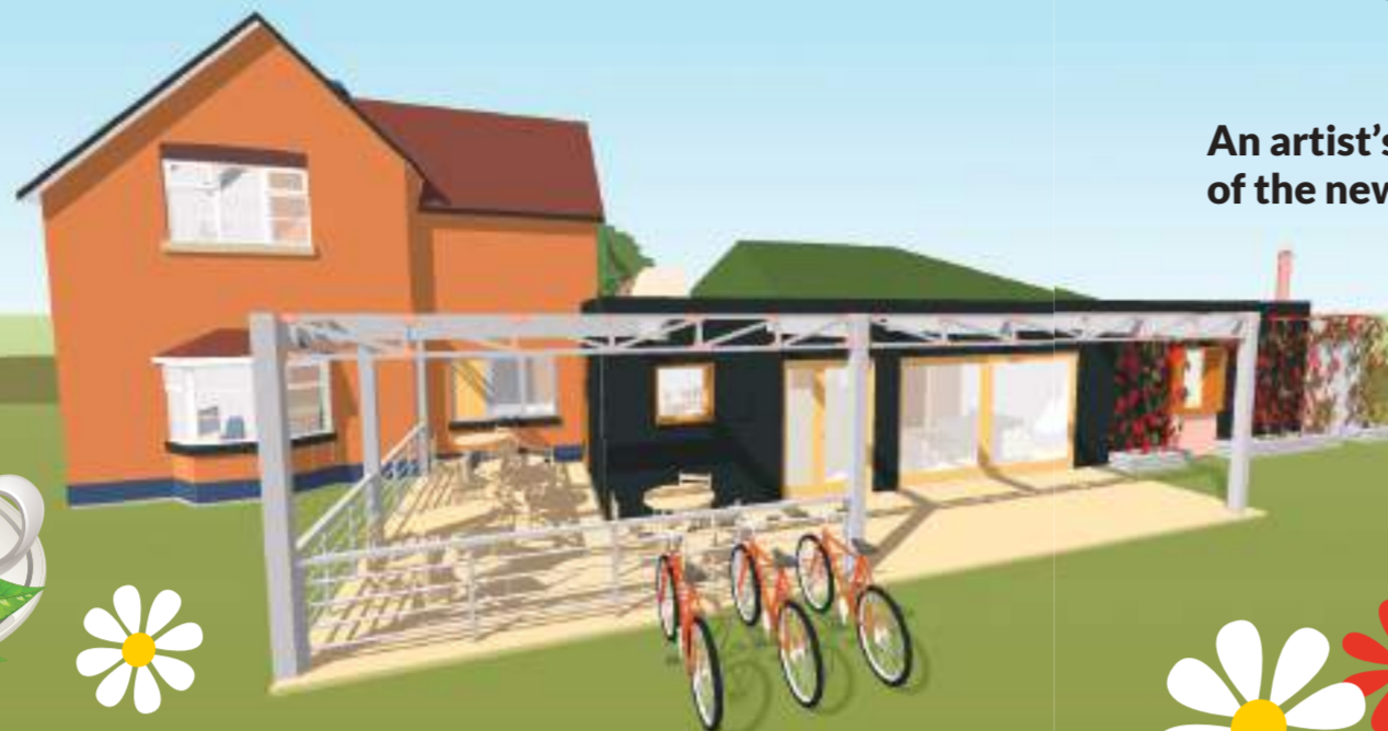
An artist's impression of the new Eco Hub