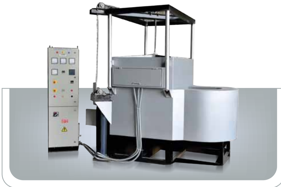
TOP HEATING HOLDING FURNACE

Silcarb manufactures Aluminum holding Furnaces using high density calcium silicate boards as the metal contact material. These Furnaces use Silicon Carbide heating