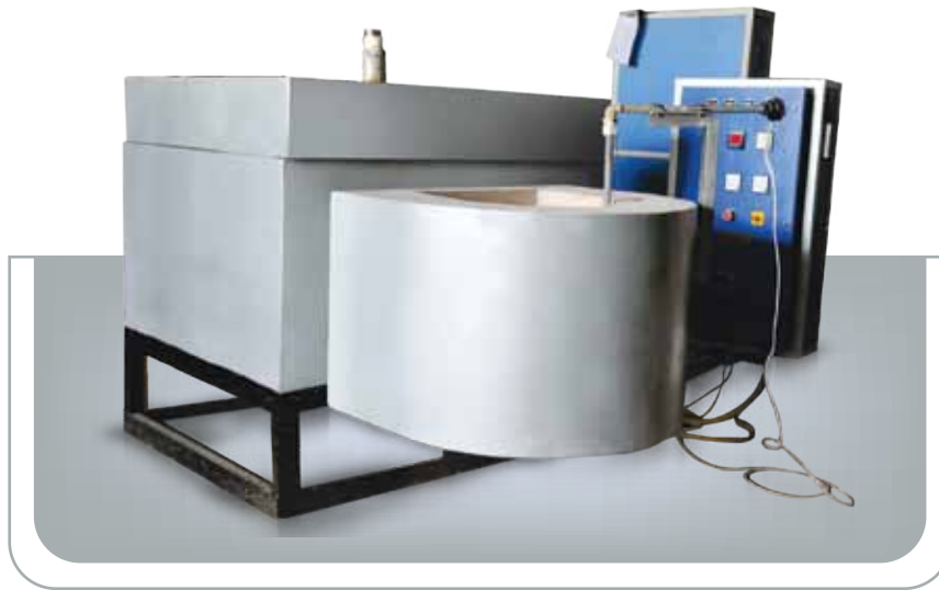
IMMERSION HOLDING FURNACE