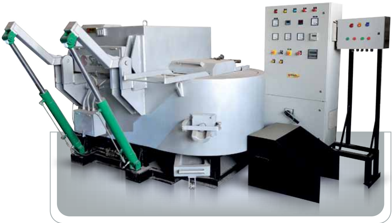
TOP HEATING HOLDING FURNACE