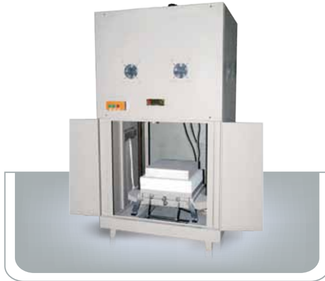
SILCARB BOTTOM LOADING HIGH TEMPERATURE FURNACE (1700° C)