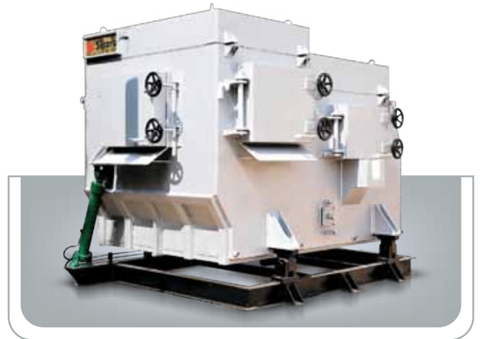
BULK SCRAP MELTER

Silcarb manufactures Reverberatory Furnaces as per customers requirements and upto capacities of 10000 kgs. Reverberatory Furnaces for scrap melting are manufactured