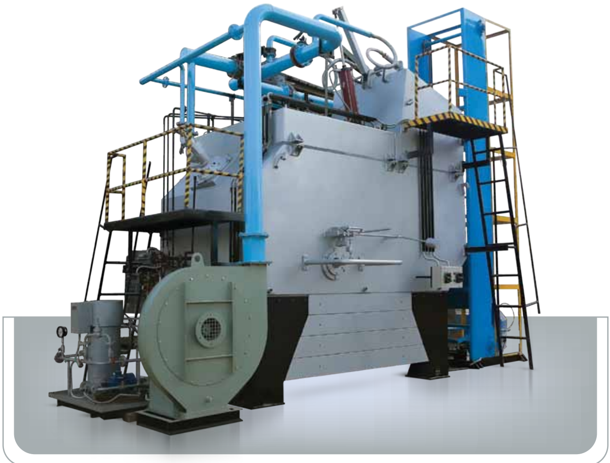
SILCARB TOWER MELTING FURNACES STATIONARY TYPE