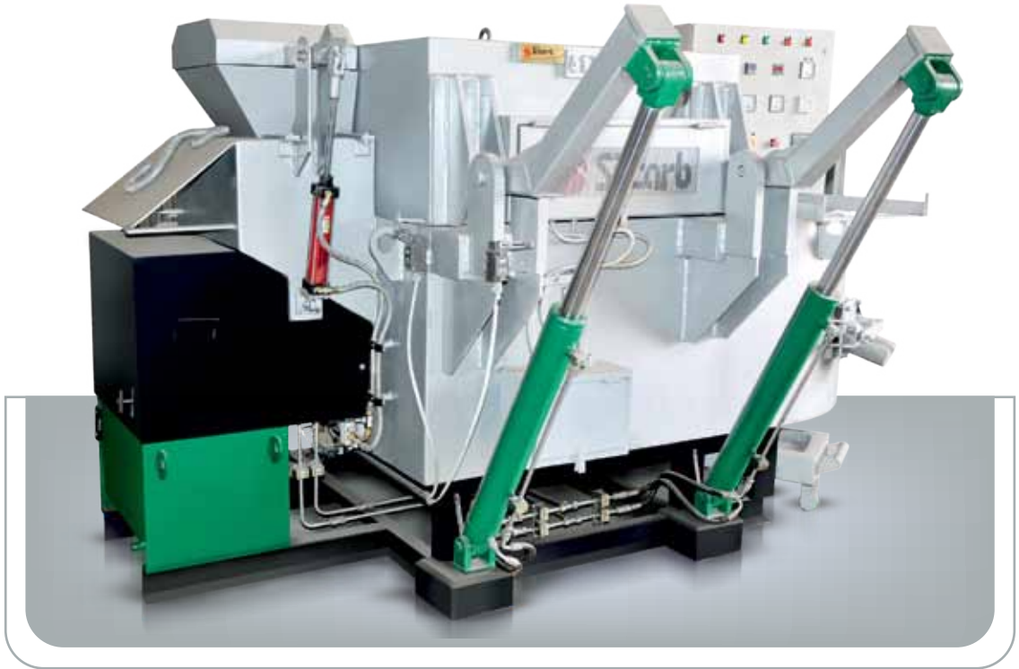
TOP HEATING HOLDING FURNACE