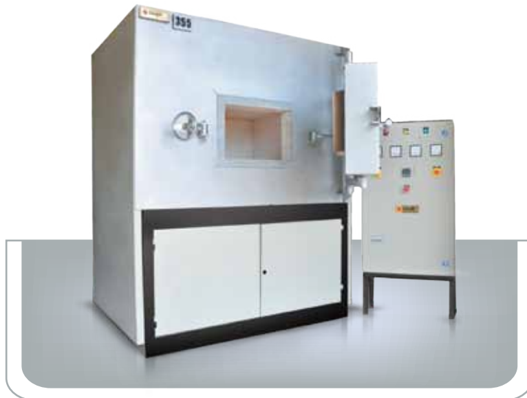
FRONT LOADING (1450° C)

Silcarb manufactures Furnace upto a temperature of 1700° C and specialized graphite Furnaces upto 2200° C. Silcarb has a number of these Furnaces in operation around the world. Silcarb uses its own high density reaction bonded Silicon Carbide Heating Elements (which is manufactured in its