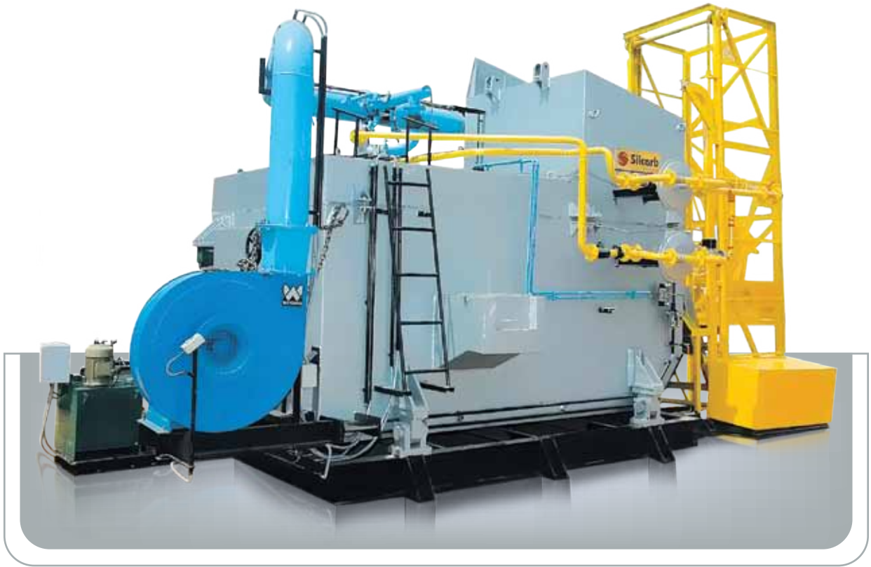
SILCARB TOWER MELTING FURNACES TILTING TYPE