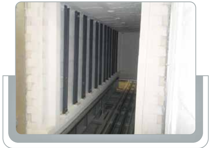
1550° C TWO CAR KILN INSTALLATION FOR CERAMIC GLAZING, WITH CONTROLLED COOLING