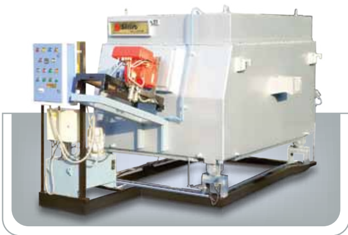
SILCARB MINI MELTER