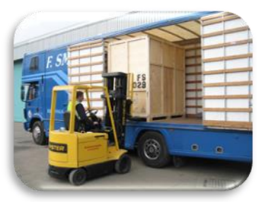
Figure 6 – Fork lifting containers on/off vehicle

Once loading is complete, the container door will be replaced and a security seal will be fitted to the door with its unique number being recorded on the inventory. The foreman will ask you to sign the inventory as