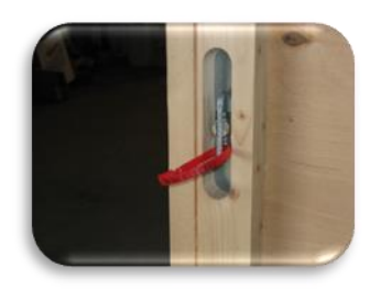
Figure 8 - Seal on container

The safety and security of your goods is taken very seriously at