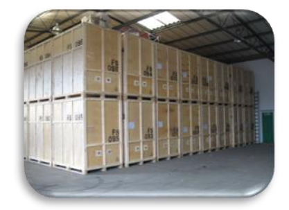
Figure 1 - Warehouse container stacks

sale of a property. This puts you in a good position as a purchaser due to the fact that you will be able to move very quickly and not depend on others below you. More importantly, it may give you better bargaining powers