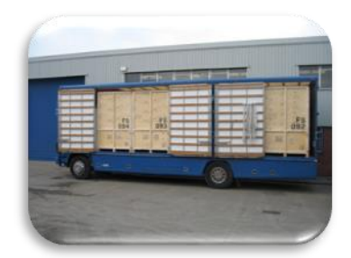
Figure 3 - Containers on Vehicle

Our specially equipped vehicles and warehouse offers safe, dry and secure storage. The storage containers will be brought to your property