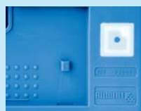
R.F. Tags can be moulded into containers at manufacture. Operating at 13.56 MHz, both read-only and read-write tags are available.