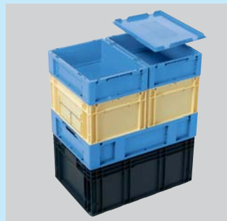
Modular and flexible: inter-stacks with VDA and Odette containers.