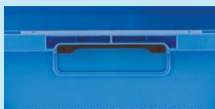
Hand-held fitted with optional non-slip 'elastomer' insert for operator comfort and safety.