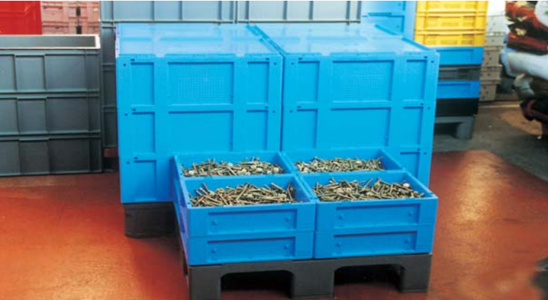
Storage and distribution of heavy loads (ref. 26R10 and 26R28).