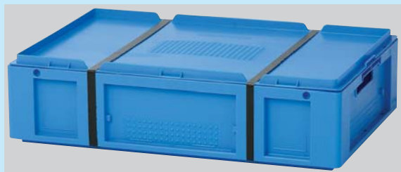
Notches in lid allow banding for secure distribution.