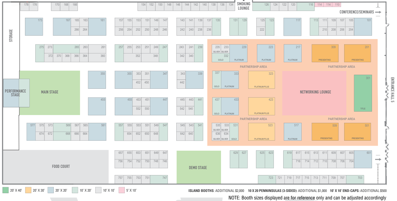
EXHIBIT HALL 5 • TORONTO INTERNATIONAL CENTRE • APRIL 23-25, 2020