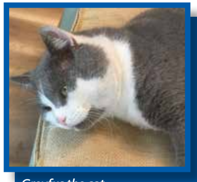
Greyfus the cat

Grace – to us this stands for a Generous spirit, Respect, Acceptance, Compassion, Empathy – all qualities we aim