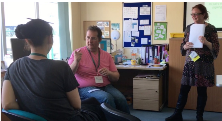
Parents attending last week's Parent Café