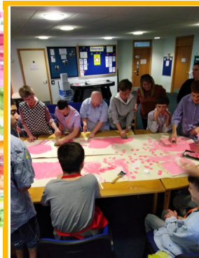
Students at The Faculty working on their Active Arts project