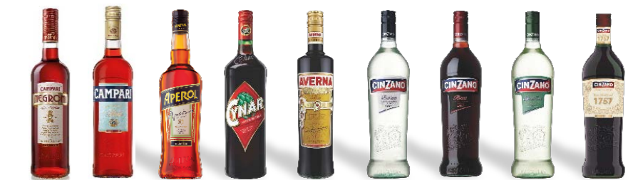
ITALIAN SPIRITS & VERMOUTH