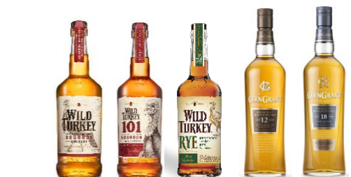
BOURBON & SCOTCH WHISKY