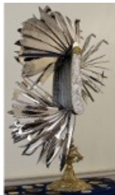
The Norfolk Knife

After the meal, the Stag pub was the venue to try some local Sheffield Ale, unfortunately not in pewter tankards. Delegates later retired to the magnificent Kenwood Hall Hotel, famous as the hotel that Dennis Taylor stayed in during his 1985 world championship snooker victory!