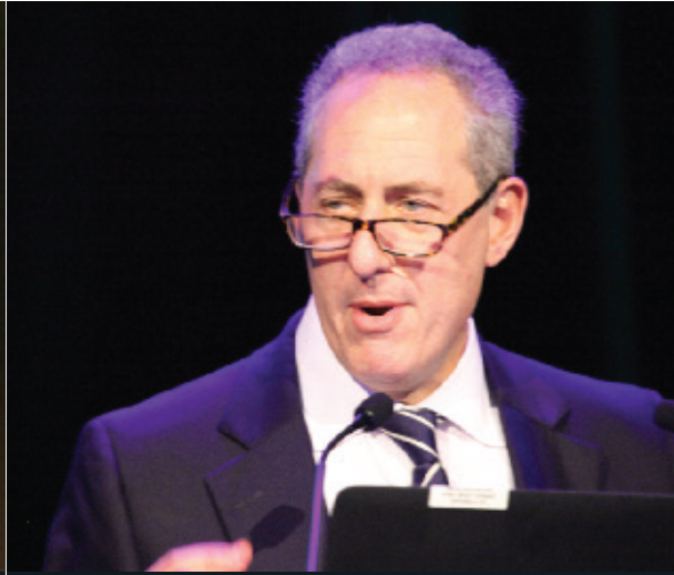
Froman defends WTO p10