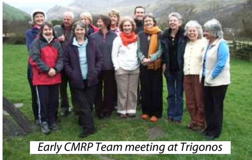
Early CMRP Team meeting at Trigonos

new home for much of our training. A few people working behind the scenes, have made possible Bangor's Teacher Training Pathway to be housed within The Mindfulness Network (MN) charity, retaining the experience of