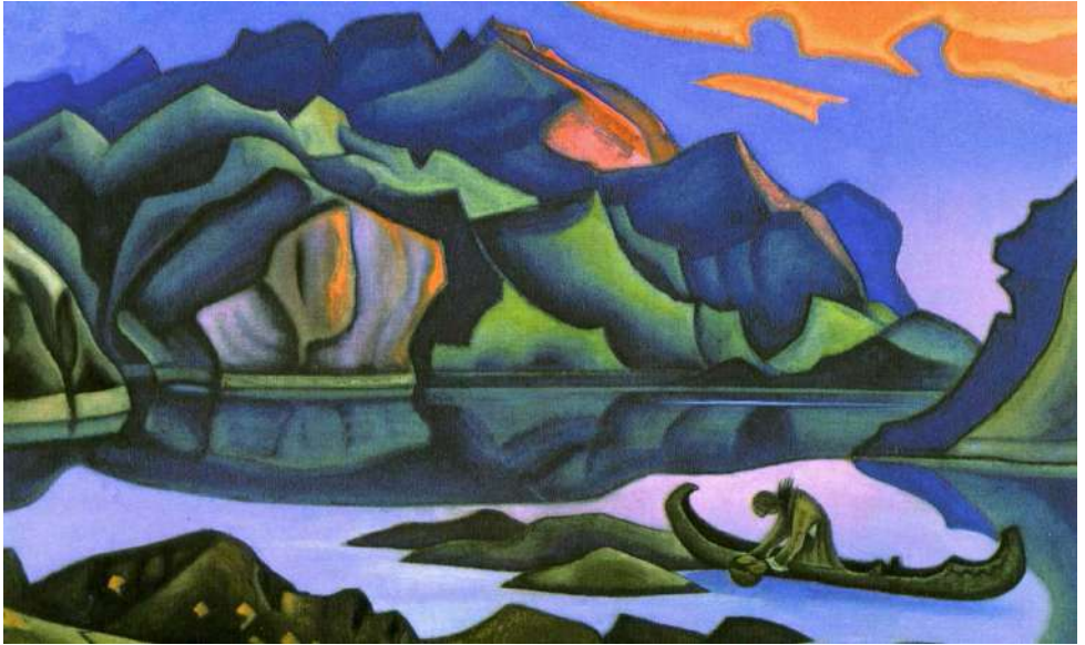
“Hidden Treasure” by Nicholas Roerich