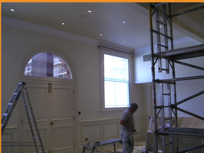
The Room undergoes it's make-over