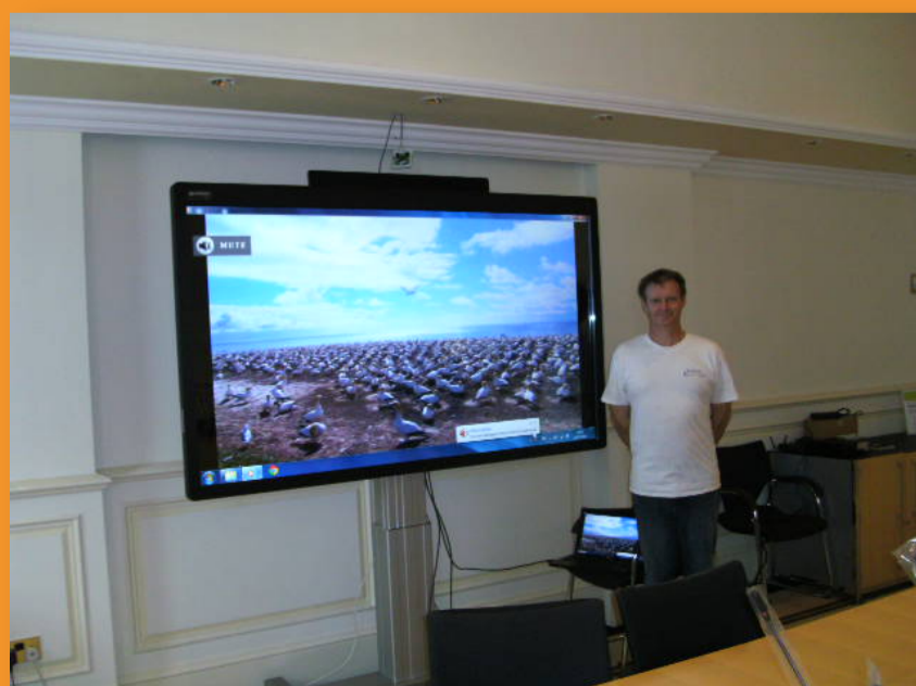
Testing the Sahara 80" CleverTouch