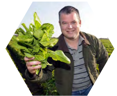
Meet the Grower