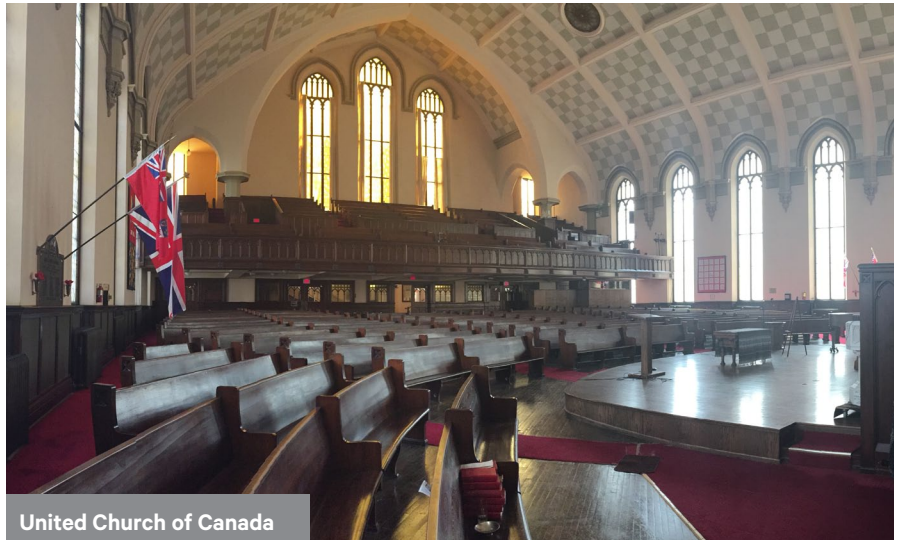
United Church of Canada