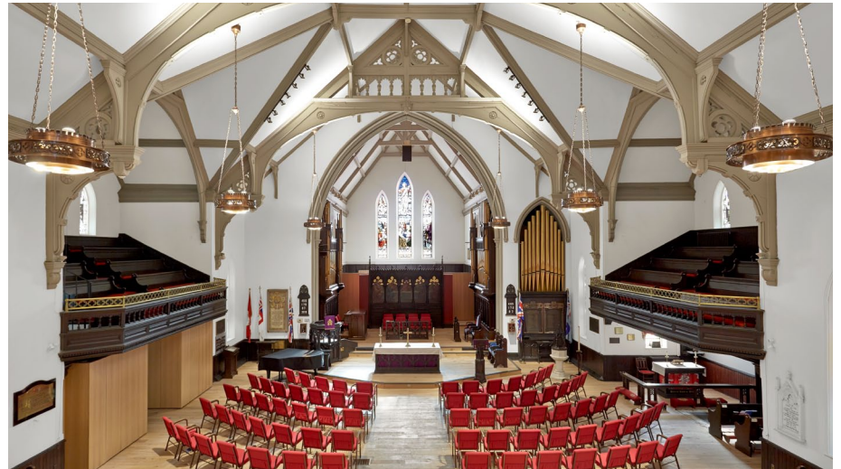
Church of the Ascension