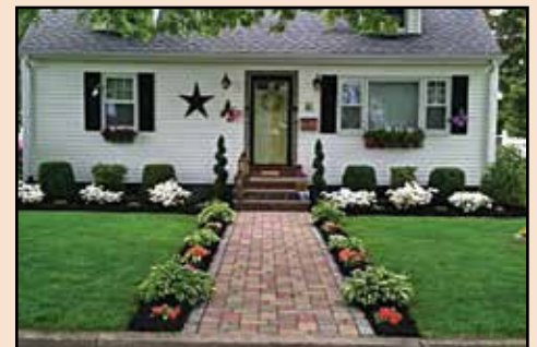
Photos of real Black Beauty lawns.