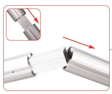
Align and slide female post over male post.