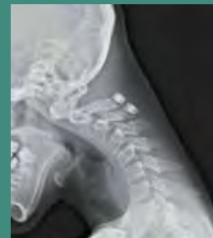
With Dynamic Visualization™