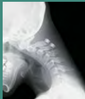
Without Dynamic Visualization™

Dynamic Visualization™ is an FDX Console exclusive.