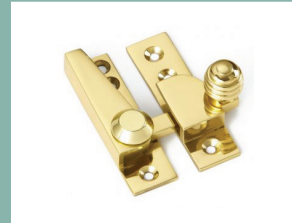
Deluxe Beehive Fastener PB, PC & SC