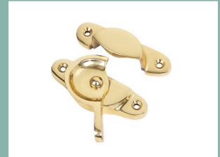
Fitch Fastener AB, PB, PC & SC