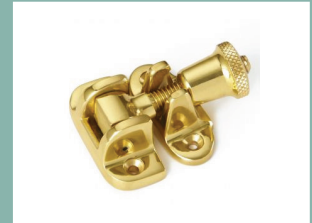
Deluxe Acorn Fastener PB, PC & SC