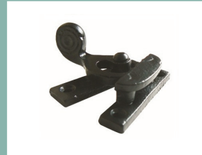
Antique Claw Fastener (non locking)