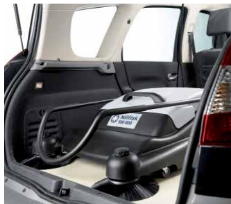
The handle can be folded without tools for storage and easy transportation