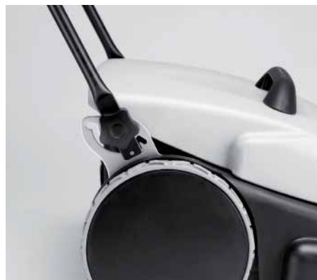
The handle can be adjusted to fit the operator height (3 positions)