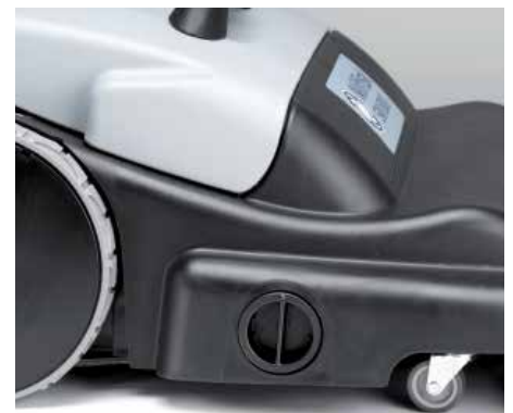
Main broom can be adjusted in 4 different positions without the use of tools.