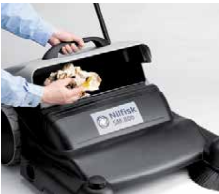
The hopper can stay in open position so it is easy to throw big items or empty a garbage bin into the hopper