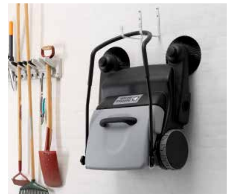
Clever handle/hopper construction keeps the hopper in place even when stored in the upright position or hung on a wall