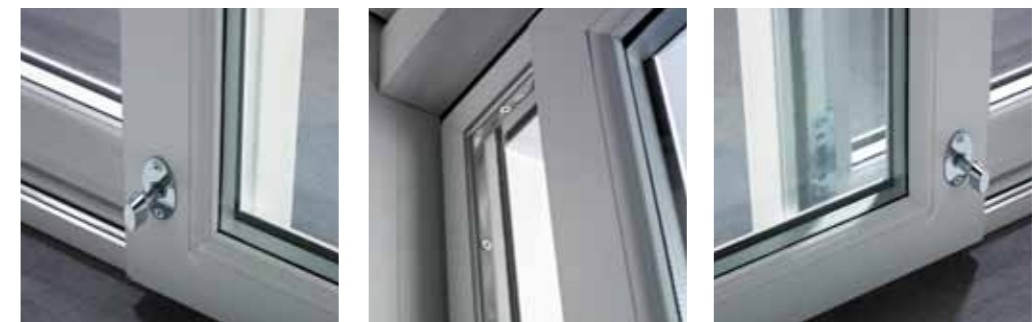
PatioMaster Secure is an optional extra to the standard range.