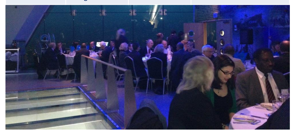
EPC members and quests relax over dinner at Congress2013 in Portsmouth's spectacular Spinnaker Tower