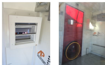
Positive & Negative Venting all in one Vent