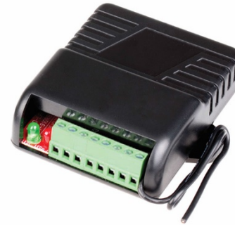
SK-910RB2Q / SK-910RB2-4Q