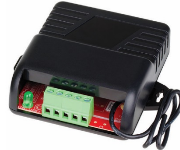
SK-910RBQ / SK-910R-4Q