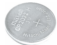
3VDC Lithium battery, CR2032