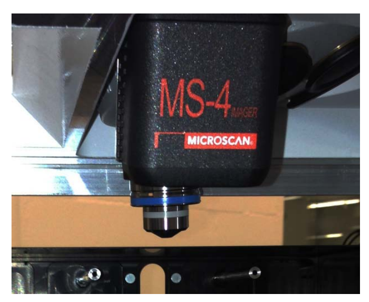
The MS-4 imager decodes the Data Matrix code on the microscope slide inside the EUROPattern Microscope.

The newly designed EUROPattern Microscope can automatically process up to 500 application spots in succession (10 carrier plates with 5 slides containing 10 sample fields each). The mechanical stage moves into a