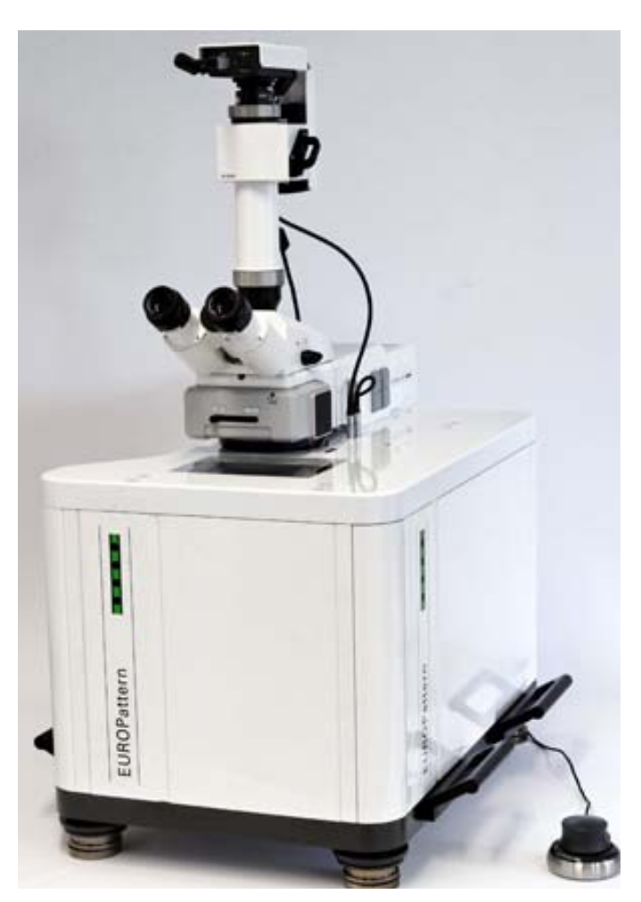
Microscan's MS-4 imager is integrated inside the EUROPattern Microscope.

EUROIMMUN has developed several innovations for the standardization and modernization of this technique, such as an activation technique, where physically or chemically activated cover glasses are coated with cultured cells or tissue sections. Frozen tissue sections are fixed to the glass