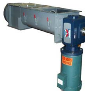
NW2 DUPLEX shown below