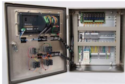
JEM-BAT-120 Digital Controller