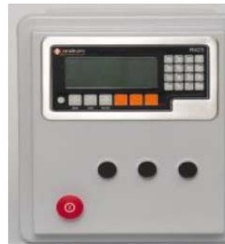
Rinstrum R423 Digital controller