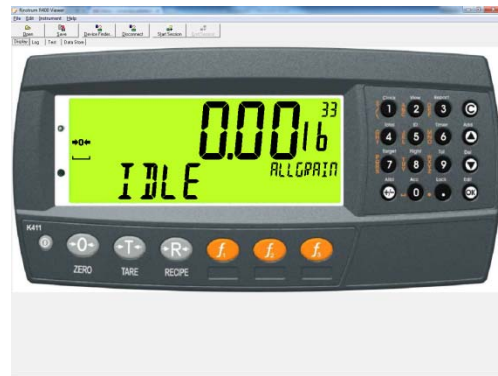
VIEW 400 SCREENSHOT

THE JEM-423-BAT DIGITAL CONTROLLER IS AVAILABLE IN 4 MODELS: